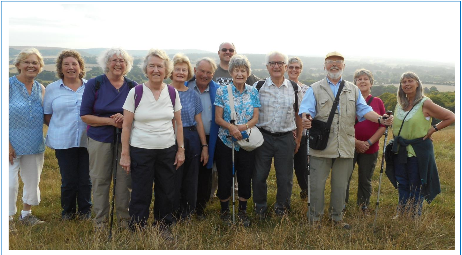
Evening walk on Scratchbury Hill overlooking Warminster

I LIFT UP MY EYES TO THE HILLS. WHERE WILL MY HELP COME FROM? MY HELP COMES FROM THE LORD, WHO MADE HEAVEN AND EARTH Psalm 121 v 1 – 2