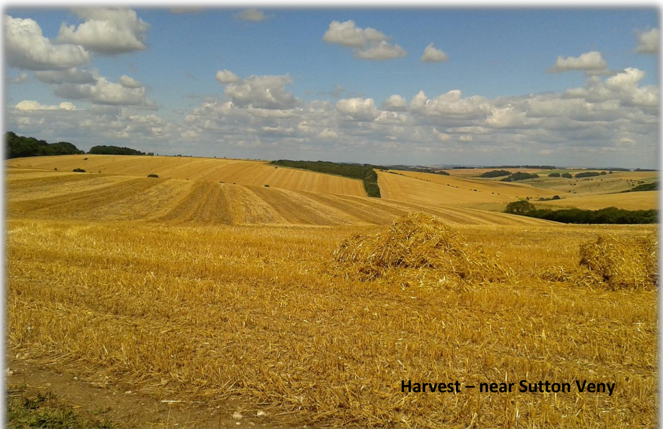
Harvest – near Sutton Veny